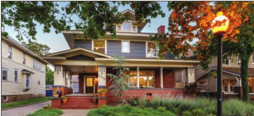
1018 NW 17th Street 4 bed | 3.5 bath | 3,695 sqft

Our daily routines and environments are changing. You may find yourself spending more time at home thinking about a new approach, and your real estate company should too. At Verbode, we closely monitor the pulse of the housing market to find opportunities that benefit our clients.