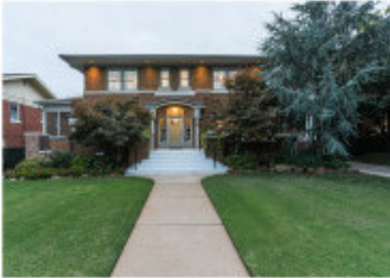
214 NW 18th St 2490 square feet 3 bed 2 bath