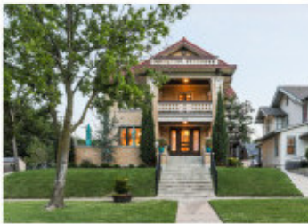
900 NW 19th St 4646 square feet 5 bed 3 bath