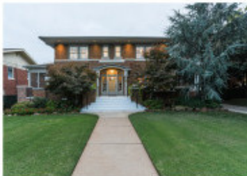
214 NW 18th St 2490 square feet 3 bed 2 bath