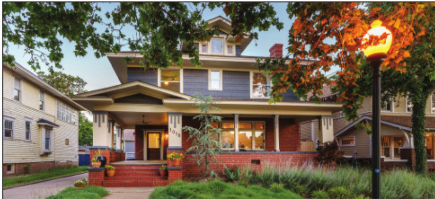
1018 NW 17th Street 4 bed | 3.5 bath | 3,695 sqft

Our daily routines and environments are changing. You may find yourself spending more time at home thinking about a new approach, and your real estate company should too. At Verbode, we closely monitor the pulse of the housing market to find opportunities that benefit our clients.