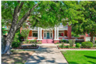
919 NW 17th St 4191 square feet 3 bed 2 bath