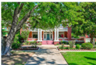
919 NW 17th St 4191 square feet 3 bed 2 bath