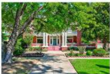
919 NW 17th St 4191 square feet 3 bed 2 bath