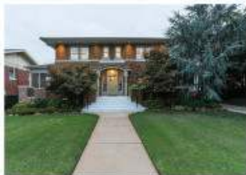
214 NW 18th St 2490 square feet 3 bed 2 bath