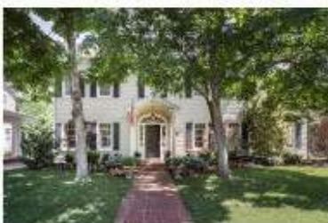
409 NW 21st St 3130 square feet 3 bed 2 bath