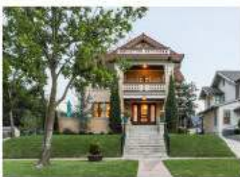
900 NW 19th St 4646 square feet 5 bed 3 bath