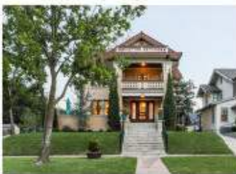
900 NW 19th St 4646 square feet 5 bed 3 bath